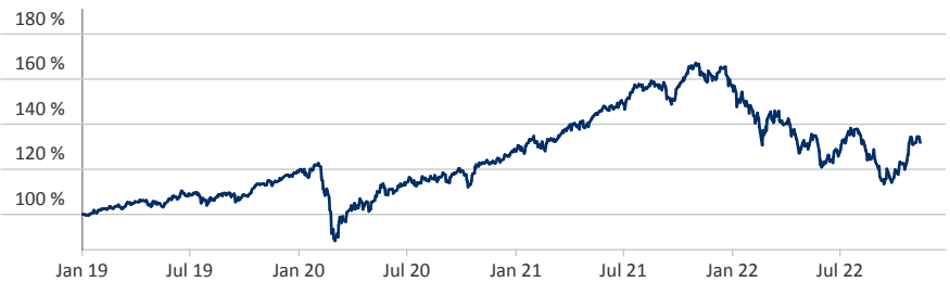
CONREN - Generations Family Business Equity - I A